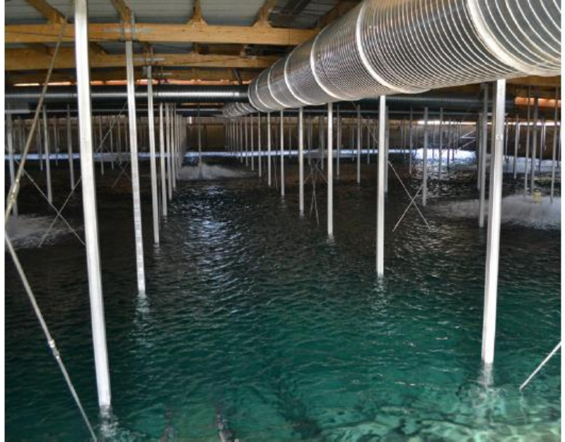
Filled More Ave. reservoir with in-tank aeration system in operation.

The part of the San Jose Water system that caused the greatest concern was the western part of the system. Water from this part of the system is treated by Santa Clara Valley Water’s Rinconada Treatment Plant and then enters the San Jose system at the 12- MG More Ave. reservoir. Five DBP sample locations downstream of the More Ave. reservoir showed significant elevations in THM levels. While the water system remained in compliance, managers at San Jose Water wanted to eliminate the risk of a future operational exceedance in the summer of 2014 – when THM levels were expected to be highest. And with no guarantee that Santa Clara Valley’s application of PAC would be sufficient to eliminate the problem, San Jose Water had to act on their own, and act fast.