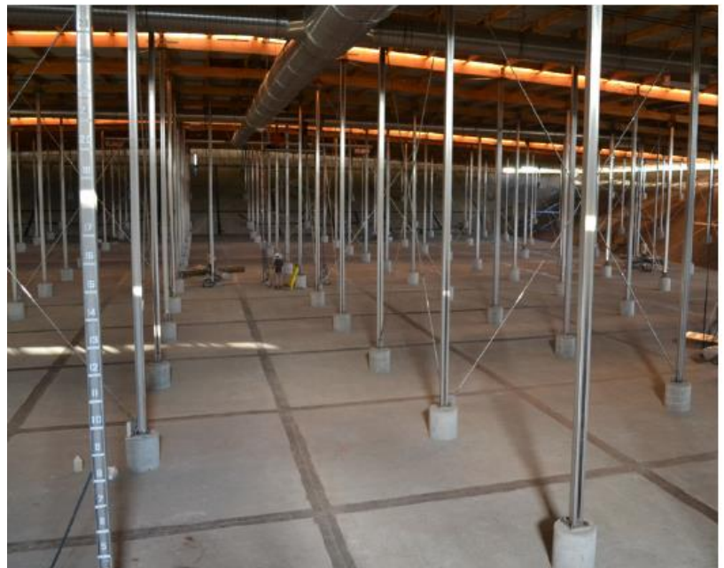
Empty More Ave. reservoir during installation of in-tank aeration system.

Santa Clara Valley Water District had several options to drive down organic levels in their water during treatment. One option was to increase the application of powdered activated carbon (PAC). PAC was used by Santa Clara historically only for taste and odor issues – not for lowering DBPs. But in February, 2014, it was not at all clear if Santa Clara would be able to use this approach to improve the water prior to its arrival in the San Jose Water system, or how much of effect it would have.