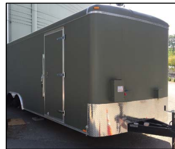
Monoclor™ trailer in place at Tice Reservoir

ammonium sulfate and 0.8% sodium hypochlorite to generate monochloramine, a more stable monochloramine residual was achieved. The water booster pump and chemical metering pumps were all located inside the trailer with tubing leading to the reservoir and Tank Shark™ mixer. Installation of the Tank Shark™ mixer did not require divers or an outage because the unit was installed through the reservoir hatch without moving parts or electrical components. Utilizing the trailer option also simplified the permitting process for EBMUD and added flexibility for potential deployment to a different tank site.